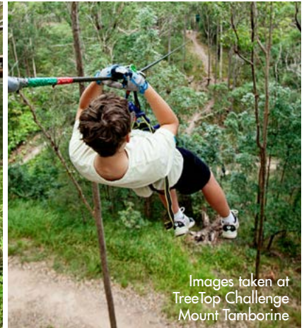
Images taken at TreeTop Challenge Mount Tamborine